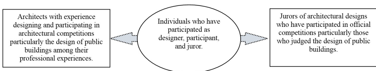
Fig. 1. Three categories employed as experts in interviews.

In grounded theory, data collection, sorting, and analysis are interconnected and done simultaneously (Strauss &