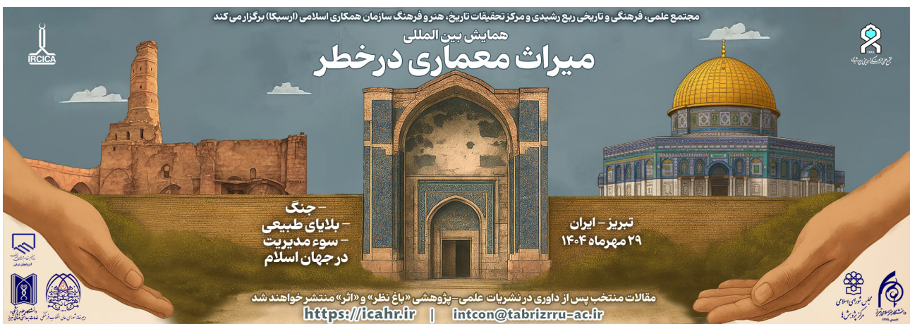
Fig. 1. Architectural Heritage at Risk. https://icahr.ir/fa/

selected for oral presentation. Additionally, from the total submissions, 18 papers were forwarded for publication in scientific-research journals approved by the Ministry of Science, Research and Technology, while the remaining accepted papers were published in the conference proceedings. This conference represents an effective step toward raising awareness, strengthening scientific collaborations, and drawing global attention to the imperative of protecting the endangered architectural heritage of the Islamic world.